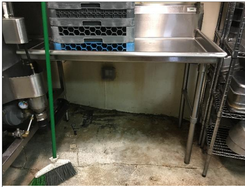
Photo 36: Minor cracking observed in exposed concrete floor area at kitchen.