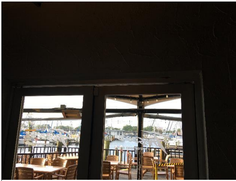
Photo 56: Emergency exit sign was not observed over doorway leading to outdoor seating area.