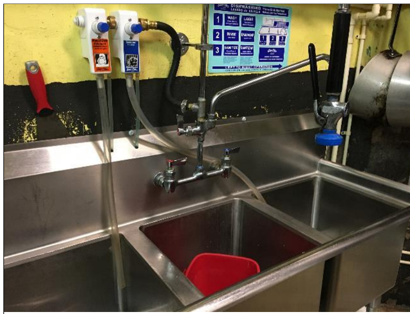
Photo 44: Typical stainless steel contact fixtures at kitchen area.