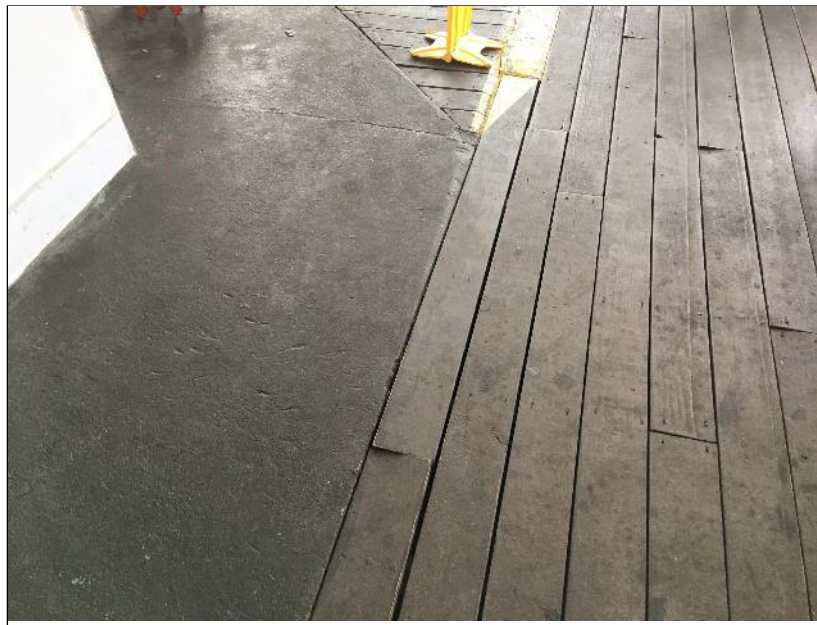
Photo 8: Transition between concrete building pad and outdoor wood deck.