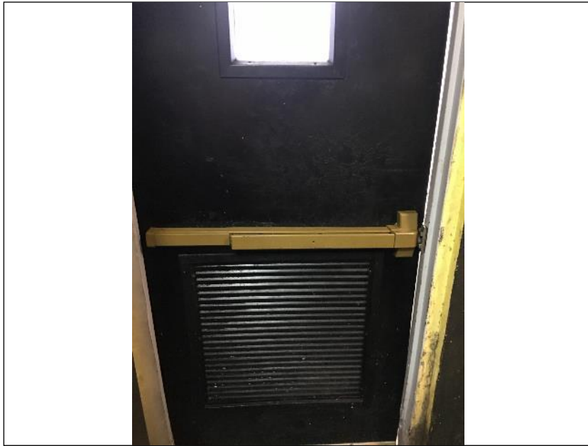
Photo 23: Steel frame service entrance on east side of building into kitchen area.