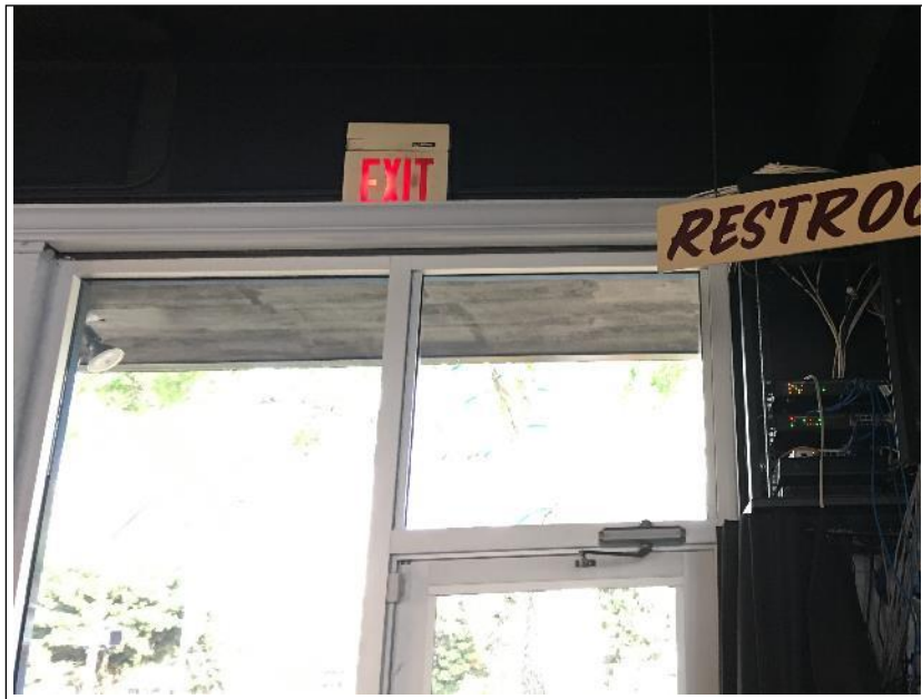
Photo 55: Emergency exit sign located over entrance on the north side of the building.