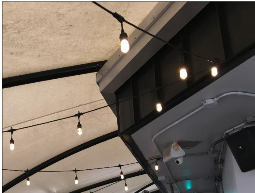
Photo 3: Typical gutter section to drain storm water runoff from roof.