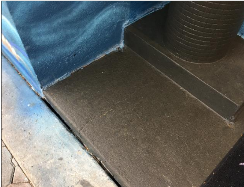
Photo 14: Building slab and support column along main entrance of building.