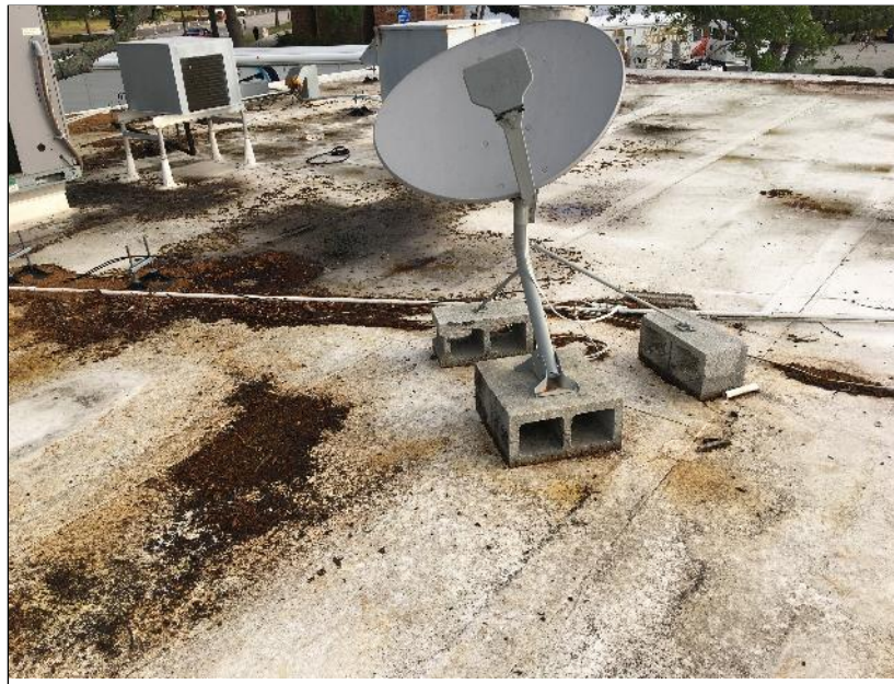
Photo 28: Accumulation of grease on roof. The satellite dish is attached to CMU blocks that are in direct contact with the roof membrane.