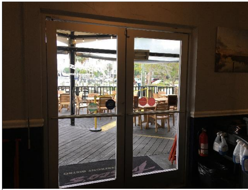
Photo 22: Double acting aluminum framed doors at main entrance from outdoor deck.