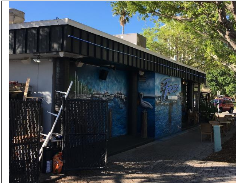
Photo 17: Typical exterior wall section with surface-applied stucco.