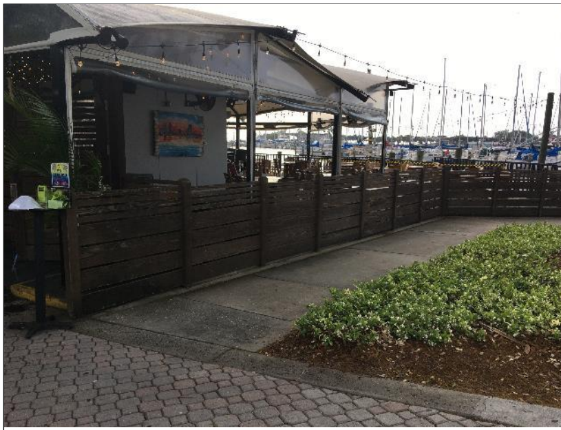
Photo 6: Access to building along Bay Shore Drive NE to main entrance at outdoor deck.