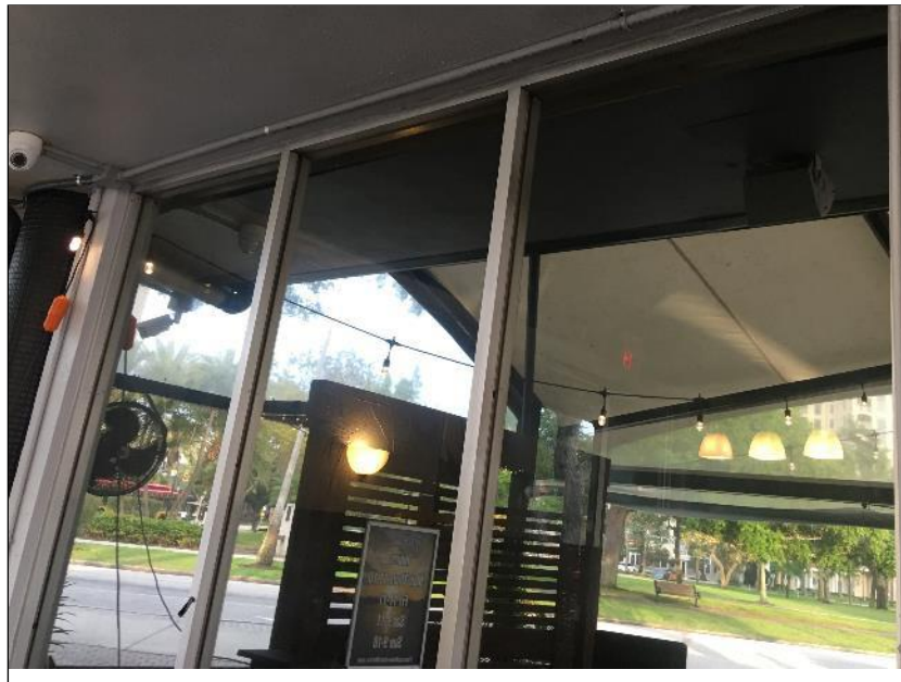
Photo 21: Aluminum-framed storefront along south side of building.