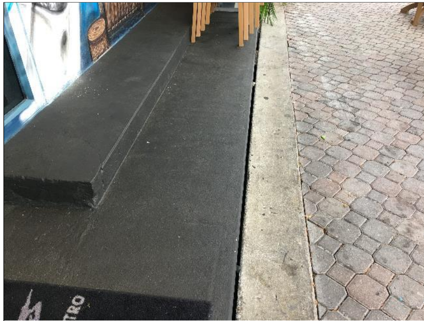
Photo 7: Building slab along main entrance on north side. The sidewalk is lined with pavers.