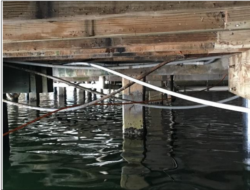
Photo 13: Driven concrete piles and beams supporting the building slab.