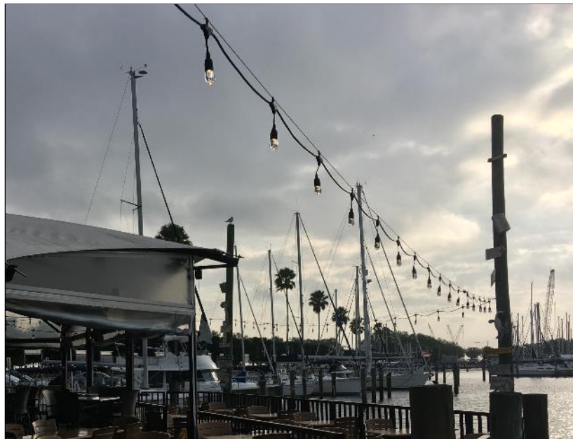
Photo 50: Typical fluorescent string lighting at outdoor seating area.