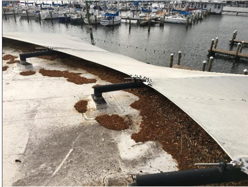
Photo 27: Accumulation of leaves and debris at canopy transition near gutters. The gutters are covered by the canopy and were not visible.