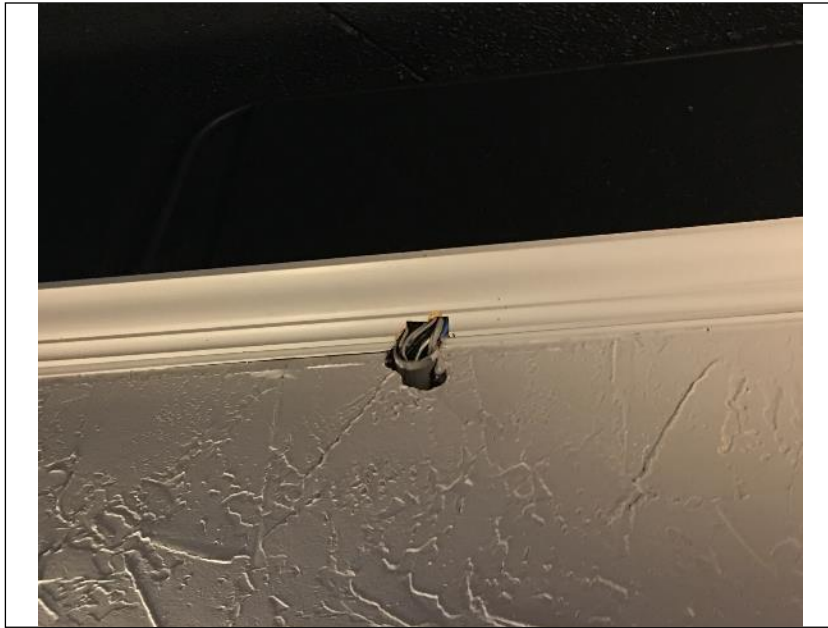
Photo 51: Unfinished low-voltage electrical wiring at top of interior wall due to sound system upgrades. According to the property manager, the wiring will be covered when upgrades are complete.